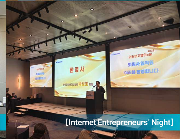
[Internet Entrepreneurs' Night]