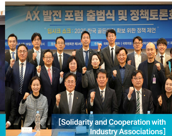
[Solidarity and Cooperation with Industry Associations]