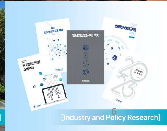
[Industry and Policy Research]