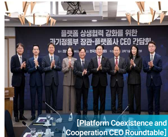
[Platform Coexistence and Cooperation CEO Roundtable]