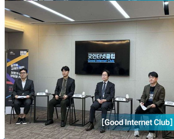
[Good Internet Club]