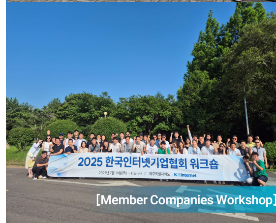
[Member Companies Workshop]